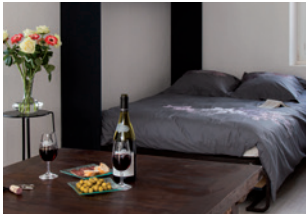
For two people.