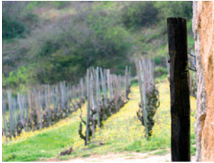
Surrounded by vineyards...