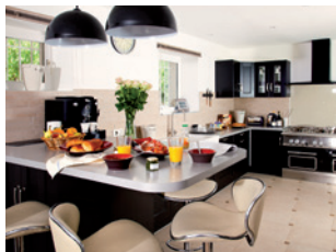
A fully equipped kitchen... worthy of a top chef!