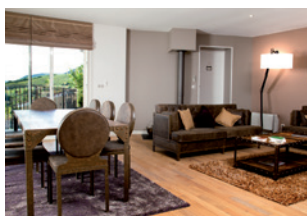
Dining area and lounge with view of the garden.