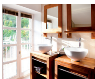
One bathroom, plus a second in the master suite and one washroom.

“Art de vivre” and conviviality are surely the best words to describe Chapoutier. All the gîtes were designed and decorated by Michel and Corinne Chapoutier and illustrate their high standards and attention to detail.