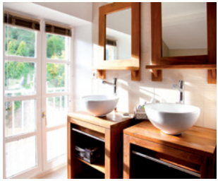
One bathroom, plus a second in the master suite and one washroom.