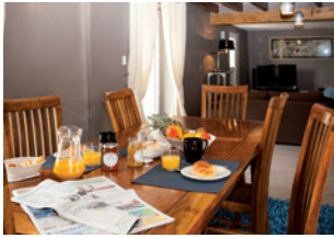
Dining area and lounge with access to the garden.