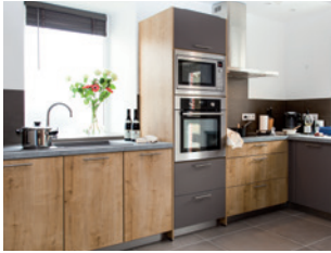
A fully equipped kitchen...